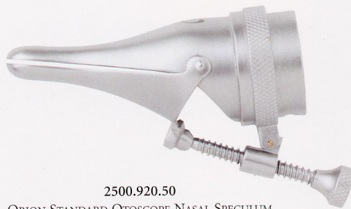
2500.920.50 ORION STANDARD OTOSCOPE NASAL SPECULUM WITH SCREW OPENING

BULB NO: 5 FOR LARYNGEAL STEMS 50 FOR OTOSCOPIES 80 FOR OPHTHALMOSCOPIES