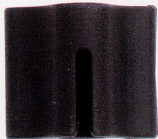
2502.926.25 ORION STANDARD LARYNGEAL STEM TONGUE WOODEN DEPRESSOR HOLDER