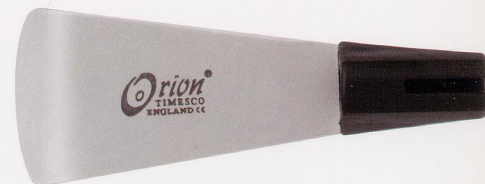
2502.925.25 ORION STANDARD LARYNGEAL STEM TONGUE DEPRESSOR