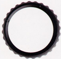
2500.825.25 ORION STANDARD OTOSCOPE MAGNIFYING LENS (3X)