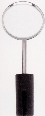
2502.905.25 ORION STANDARD LARYNGEAL STEM MIRROR NO: 3 20MM DIA