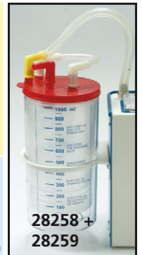
28258 + 28259