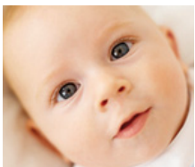
In vitro Fertilization (IVF) Clinics / University Hospitals