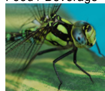
Plant / Insect Growth