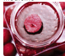
Food / Beverage