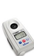
r 2 mini