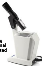
Goldberg w/Optional Illuminated Stand