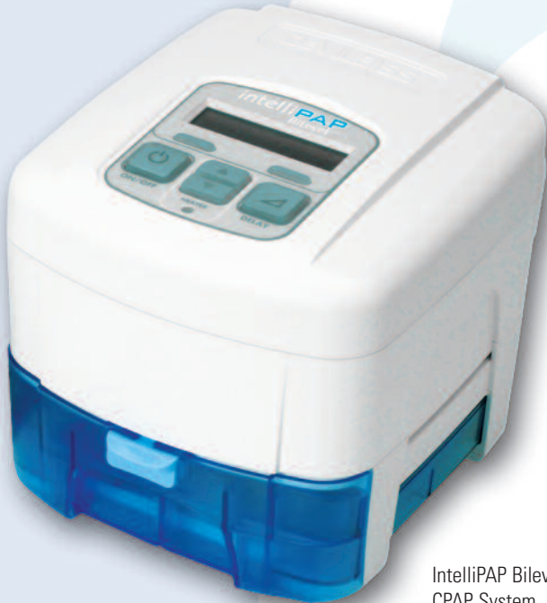
IntelliPAP Bilevel S CPAP System (Model DV55D-HH)