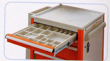
活動針劑盤 Removable injection tray