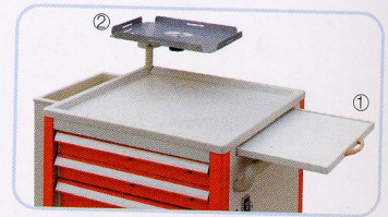
① ABS塑鋼拉板 ABS pull-out shelf

5" polytech castor, quiet, dust-prevention, flexible transportation.