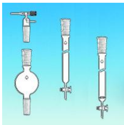
COLUMN 64MMID 10IN NO DISC

Ordering Information: Delrin joint clamps also available. Column, Flow Control Adapter, and Reservoir must be ordered separately. For custom lengths and diameters, contact your VWR representative.