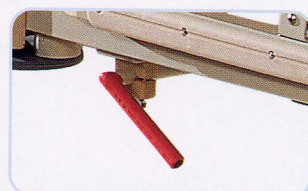
床兩側配置快速復位拉手，方便操作，符合快速急救要求。 CPR handle on both side of the bed , easy to operate, available for emergency.