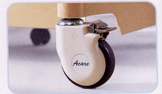
5寸豪華輪 5" luxury castors.

24V DC output voltage, Germany-made Dewert motors, owned CE, EMC, UL approved actuator, Quiet, easy to maintain