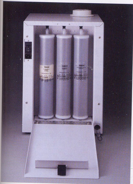
Rear cartridge access door