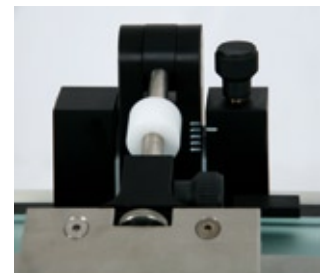
Sight check during honing