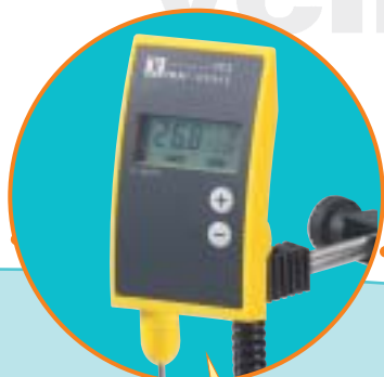
TC 2 Id-Nr. 3349000

The holding rod is used to support the temperature controller TC 2 to the boss head clamp H 44 and the support rod H 16 V .