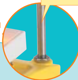
H 16 V Id-Nr. 1545100