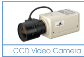
CCD Video Camera