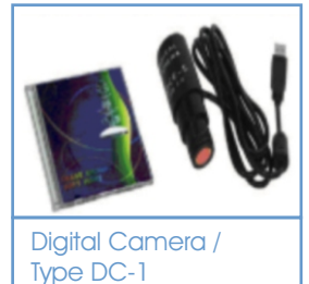
Digital Camera / Type DC-1