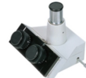
Trinocular Viewing Head