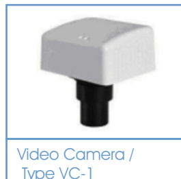
Video Camera / Type VC-1