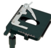
Double layered Stage