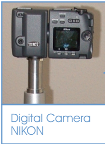
Digital Camera NIKON