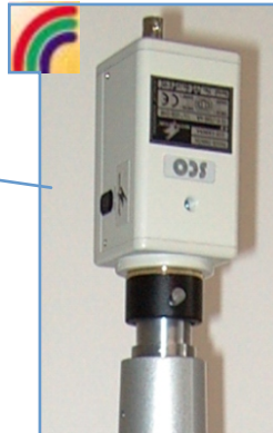
CCD Video Camera