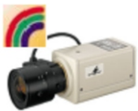
Video viewset with Video camera and adapters