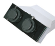
Binocular Viewing head