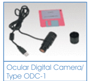
Ocular Digital Camera/ Type ODC-1