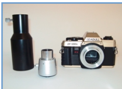
Photography set with reflex camera & adapter