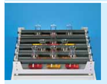
Order No. 3965

for the shaking platform, 420 x 420 mm, for slow moving of e.g. of nutritions in Petri dishes.