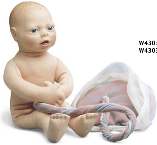
W43038 / W43039