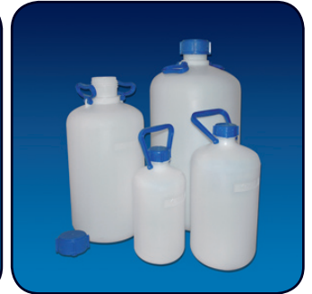
art. 1644, 1646, 1648 & 1650