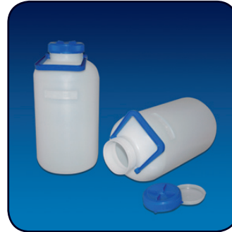
art. 1640 & art. 1642