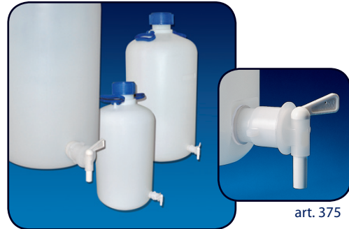
art. 1660, 1662, 1664 & 1666