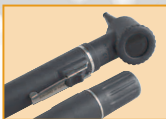
The compact and robust diagnostic penlights are reliable aids, which find a place everywhere.