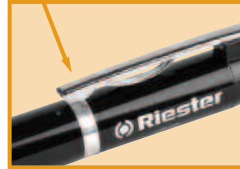
fortelux® N is switched on by lightly pressing the clip.