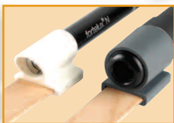
Riester pocket diagnostic penlights can be used as illuminated tongue blade holders.