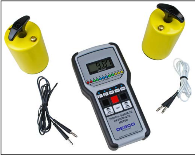
Figure 1. Desco Digital Surface Resistance Meter Kit