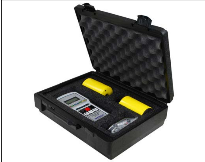
Figure 2. Desco 19787 Digital Surface Resistance Meter Kit