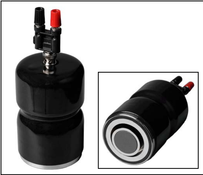
Figure 7. Desco 50005 Concentric Ring Probe

The Desco 50005 Concentric Ring Probe is an instrument to be used in conjunction with a resistance meter, such as the Desco 19787 Digital Surface Resistance Meter, to measure surface resistance per ANSI/ESD STM11.11 the test method listed in Packaging standard ANSI/ESD S541 for surface resistance of planar materials.