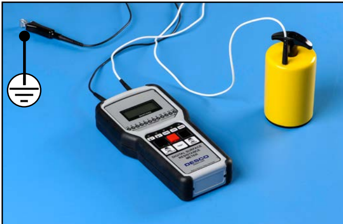
Figure 5. Rtg test setup

If the measurement is outside acceptable limits, clean the surface with an ESD cleaner containing no insulative silicone such as Reztore™ Antistatic Surface & Mat Cleaner , and re-test to determine if the cause of failure is an insulative dirt layer or the ESD worksurface material.