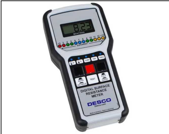
Figure 3. Desco 19788 Digital Surface Resistance Meter