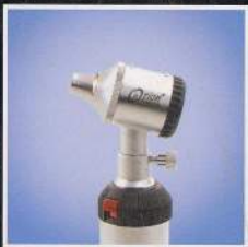
With Otolaryngoscope Adaptor