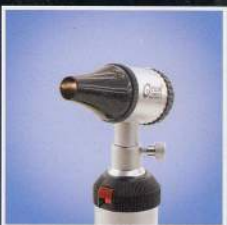
With Nasal Speculum Plastic