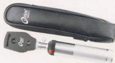
2501.250.50 STANDARD POUCH