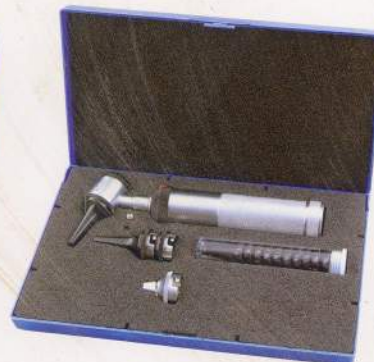
2500.100.85 STANDARD DELUXE HARD CASE