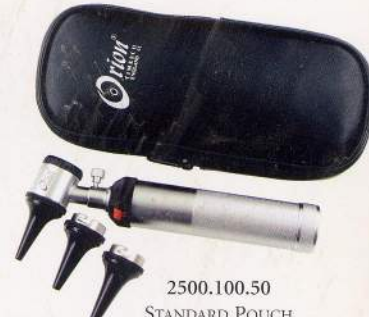
2500.100.50 STANDARD POUCH