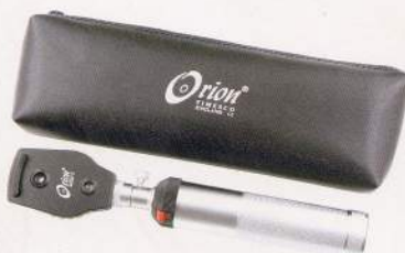
2501.250.25 STANDARD ZIPPER