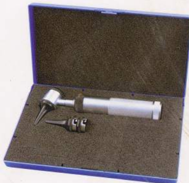
2500.100.75 STANDARD HARD CASE