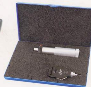
2501.250.75 STANDARD HARD CASE