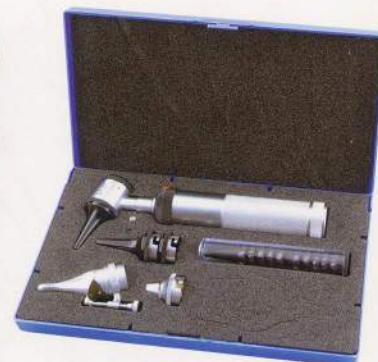
2500.100.90 STANDARD DELUXE OTO + NASO HARD CASE