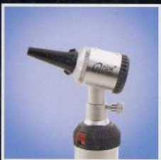
With Otolaryngoscope Adaptor and Disposable Speculum