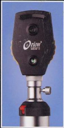
With Ophthalmoscope Head