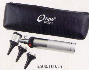
2500.100.25 STANDARD ZIPPER

Many Orion Otolaryngoscope and Diagnostic sets are supplied with disposable Otolaryngoscope speculum connectors. The inexpensive disposable speculums are particularly useful in messy aural examination or whenever cross contamination is an issue.