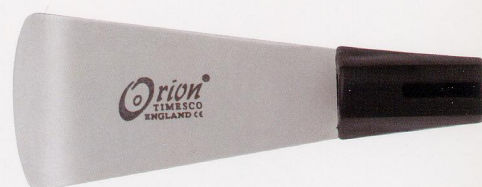
2502.925.25 ORION STANDARD LARYNGEAL STEM TONGUE DEPRESSOR