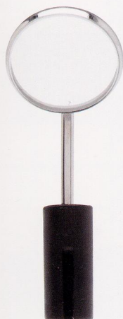
2502.905.25 ORION STANDARD LARYNGEAL STEM MIRROR NO: 3 20MM DIA