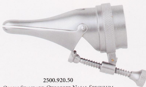
2500.920.50 ORION STANDARD OTOSCOPE NASAL SPECULUM WITH SCREW OPENING