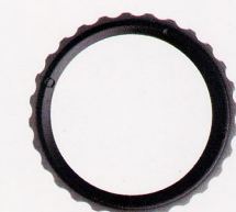
2500.825.25 ORION STANDARD OTOSCOPE MAGNIFYING LENS (3X)