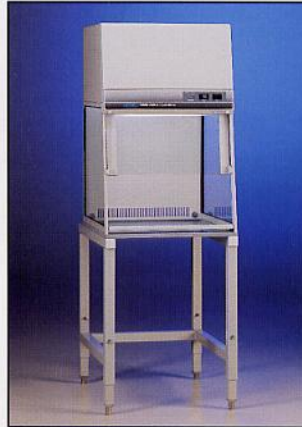
Purifier Vertical Clean Bench 3740000 on Solid Epoxy Dished Work Surface 4862100 and Adjustable Height Base Stand 3746700.