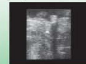
Ovary & Uterus, Bovine