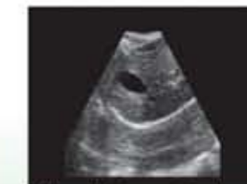
Hepatic Tissue, Canine