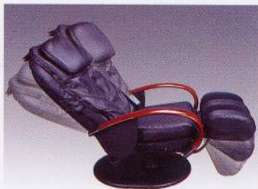
Adjustable backrest can be reclined at about 105° through 165° degrees.