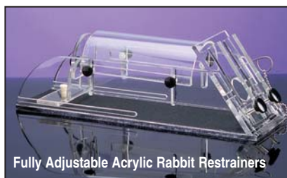
Fully Adjustable Acrylic Rabbit Restrainers