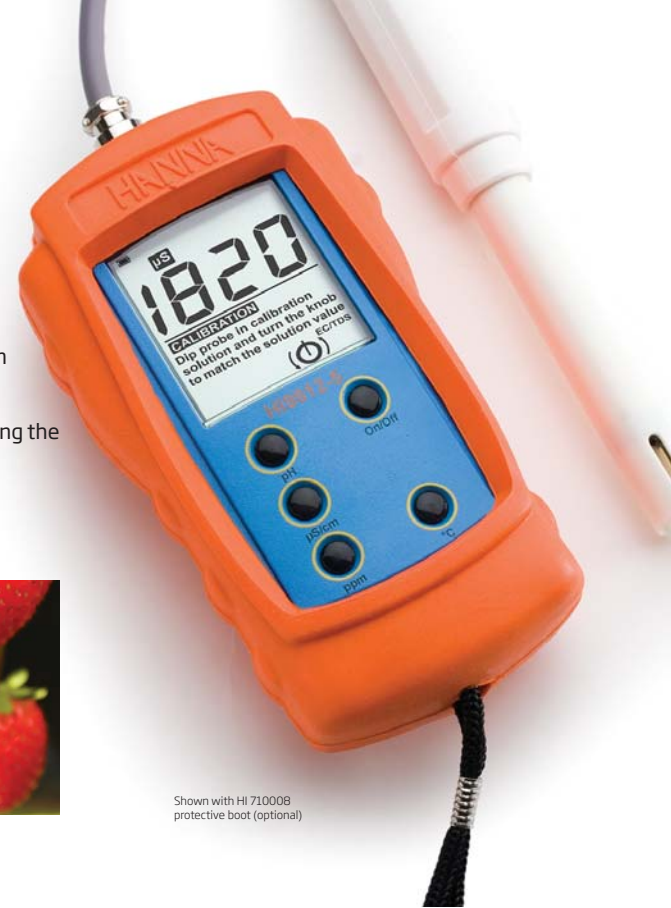
Shown with HI 710008 protective boot (optional)