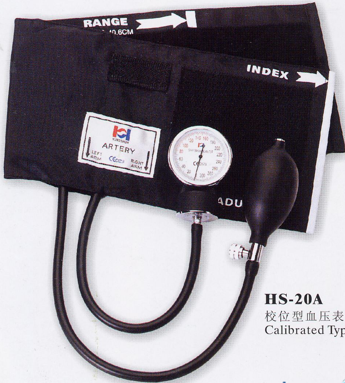
HS-20A 校位型血压表 Calibrated Type