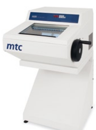
Benchtop Cryostat MTC – optional with height adjustable support