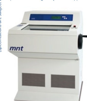
Fully automatic Cryostat MNT