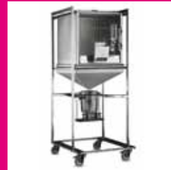
Metabolic Cage for Rabbits. Compliant with ETS123 and UK directives.

To maximise operational efficiency and learn more about these products contact your local representative.