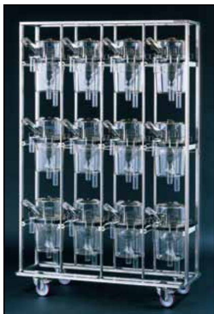
3M12D100 Vertical type rack for 12 cages