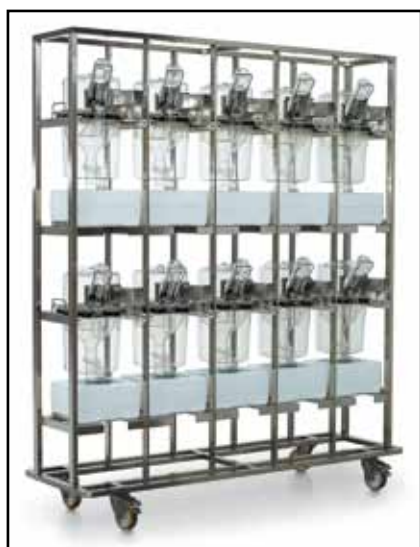
3M10B100UC Rack for 10 cages 3700M002UC (metabolic and diuresis cage collection chiller)