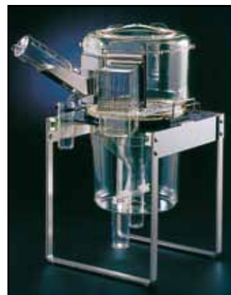
3701M081 - Metabolic cages for rats over 300g.