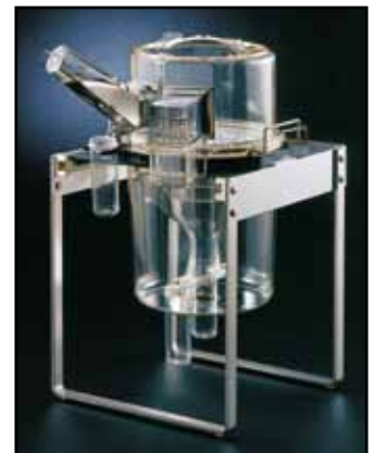
3700M061 - Metabolic cage for rats under 150g. 3700M071 - Metabolic cage for rats from 150g to 300g.