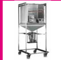
Metabolic Cage for Marmosets. Compliant with ETS123 and UK directives.