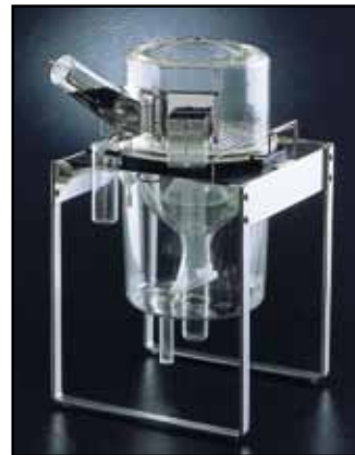
3700M022 - Metabolic cage for mice with double chamber feeder.