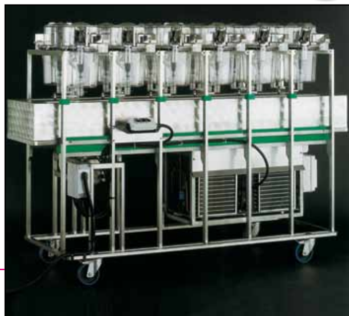
3M12B940 Refrigerated collection rack for 12 cages