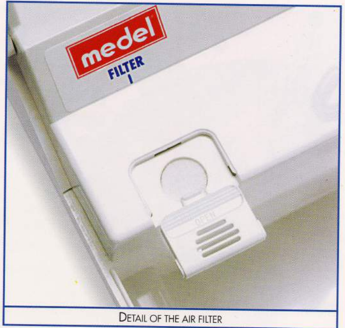
DETAIL OF THE AIR FILTER