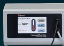
Homeothermic Monitoring System