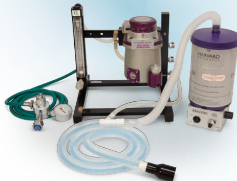
Tabletop Anesthesia System with MiniVac Active Scavenging