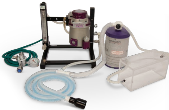
Tabletop Anesthesia System with Induction Box and Passive Scavenging