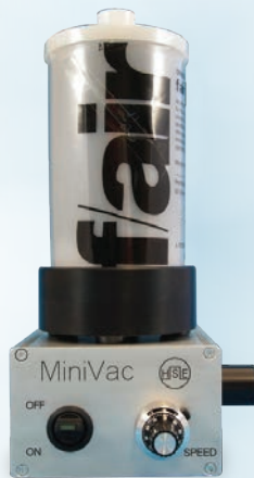
MiniVac Gas Evacuation Unit with F/Air Canister