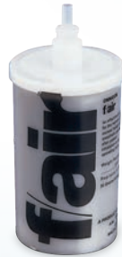
F/Air Filter Canister