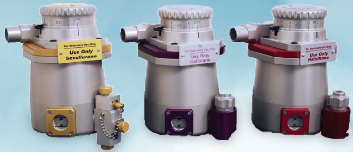
Cage Mount type Vaporizers