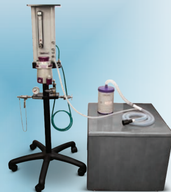
Mobile Anesthesia System with Passive Scavenging (table not included)