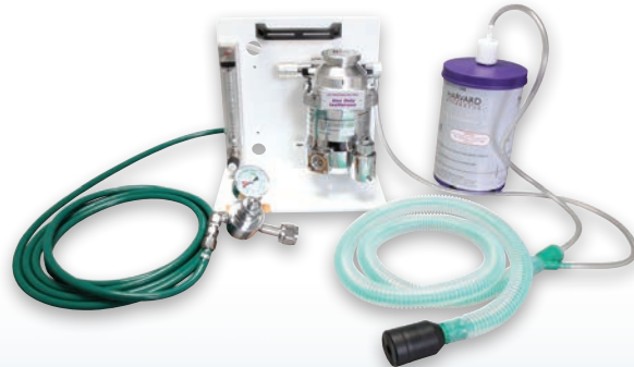
Harvard Apparatus Single Animal Isoflurane System