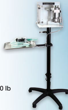
Harvard Apparatus Mobile Single Animal System