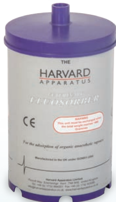
Fluosorber Filter Canister