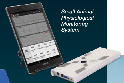
Small Animal Physiological Monitoring System