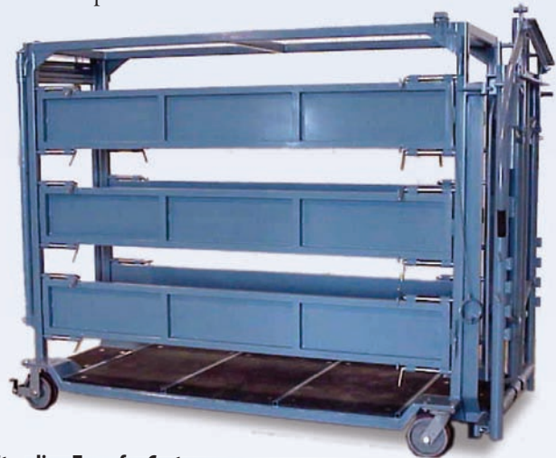
Standing Transfer Cart