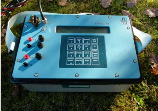
SYSCAL R2 unit