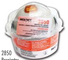
2850 Respirator Locker