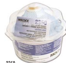
2350 Respirator Locker