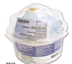
2350 Respirator Locker