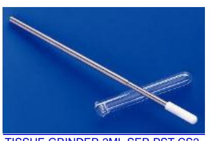
TISSUE GRINDER 2ML SER PST C

Glass meets ASTM Type 1 Class A and USP Type 1 standards.