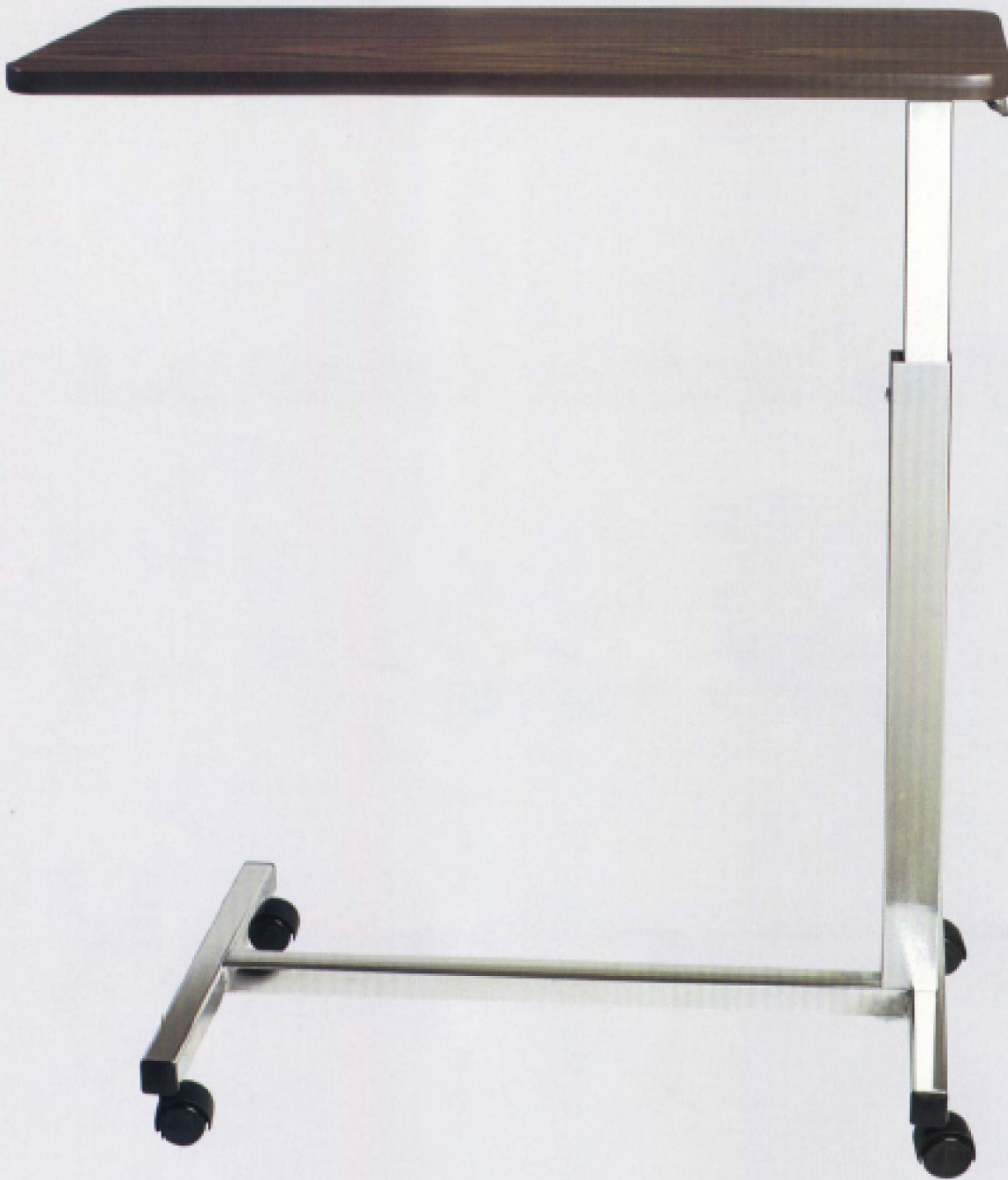
Automatic Overbed Table/Model 1010H, 1010U Long-Term Care Tables