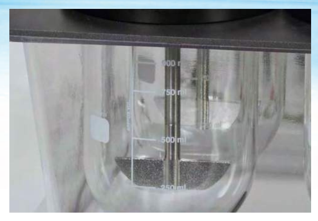
Apparatus 2 (Paddle)