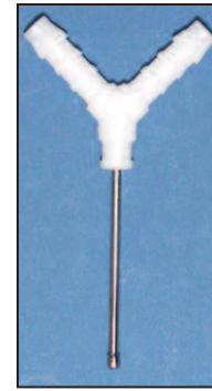
Intubation Cannula with Y-Adapter