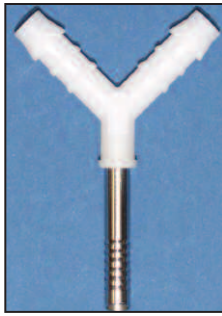
Tracheal Cannula with Y-Adapter