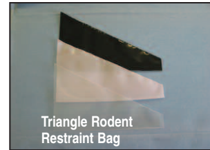
Triangle Rodent Restraint Bag