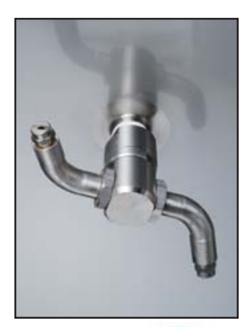
Fast decon cycles