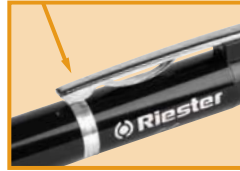
fortelux® N is switched on by lightly pressing the clip.