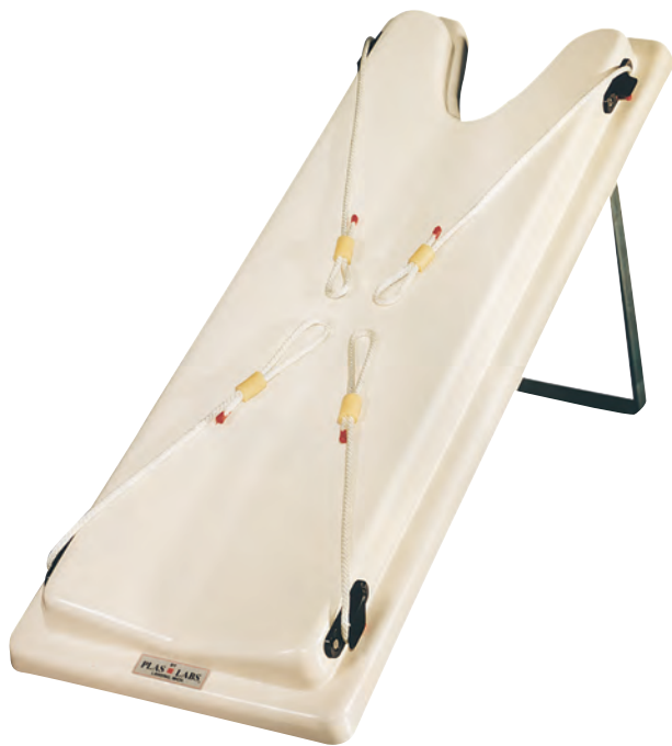
509-RS24, two sizes available: 24" and 30"